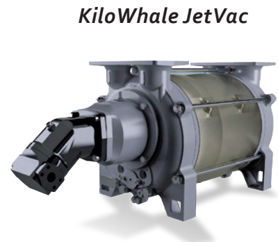
KiloWhale JetVac Chassis Mounted Pump 2000i Liquid Ring 1700m3/hr (1000cfm) or European Cast Iron 2200m3/hr (1300cfm)

Key: Working range in the Extended position Working range in the Retracted position